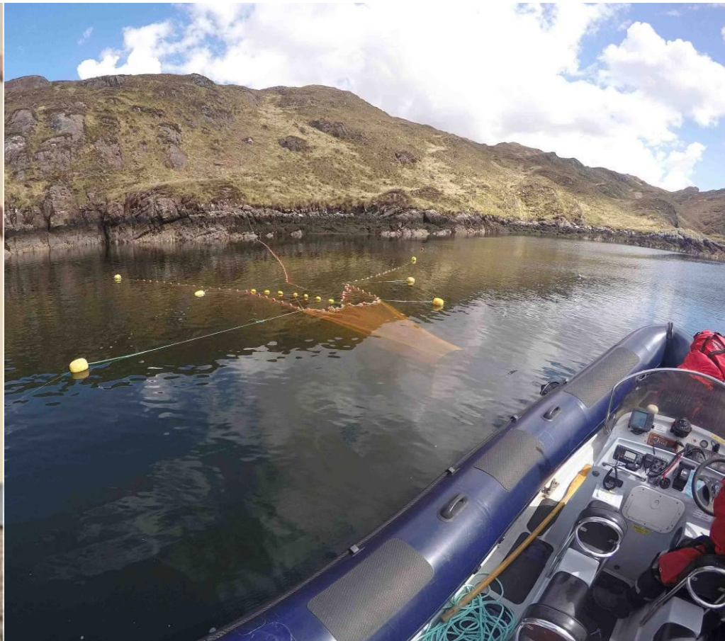
Bag-net in operation

For any further information regarding this Marine Notice, please contact Inland Fisheries Ireland: